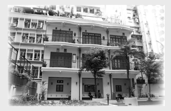
Built in 1938, Wing Fung House was a home to many for 71 years.

All tours are led by experienced guides. For more information and registration details, please visit www.wcna.org.hk/heritagetour.